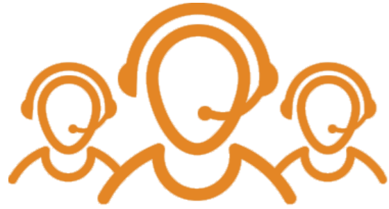
Service Level Average